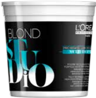
MULTI-TECHNIQUES 8 POWDER