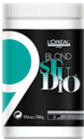
BLOND STUDIO 9 POWDER