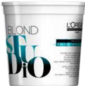
FREEHAND TECHNIQUES POWDER