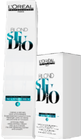
MAJIMÈCHES STEP 1 & 2 CREAM