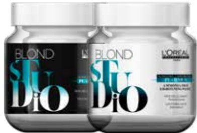
PLATINIUM PLUS CLASSIC & AMMONIA-FREE PASTE