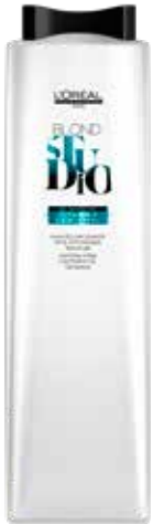
SUNKISSED LIGHTENING OIL