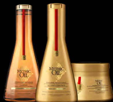
Thick Hair Regimen Shampoo, Conditioner, Masque