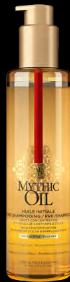
HUILE INITIALE For Thick Hair