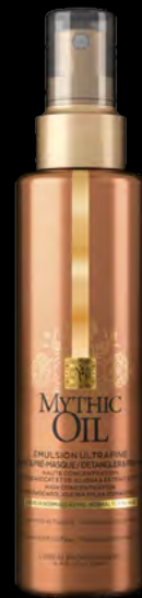
EMULSION ULTRAFINE For Normal/Fine Hair