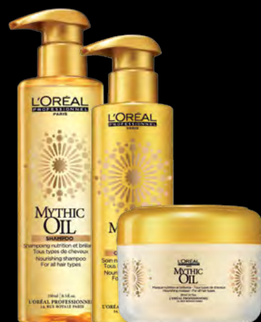
Nourishing Haircare Shampoo, Conditioner, Masque