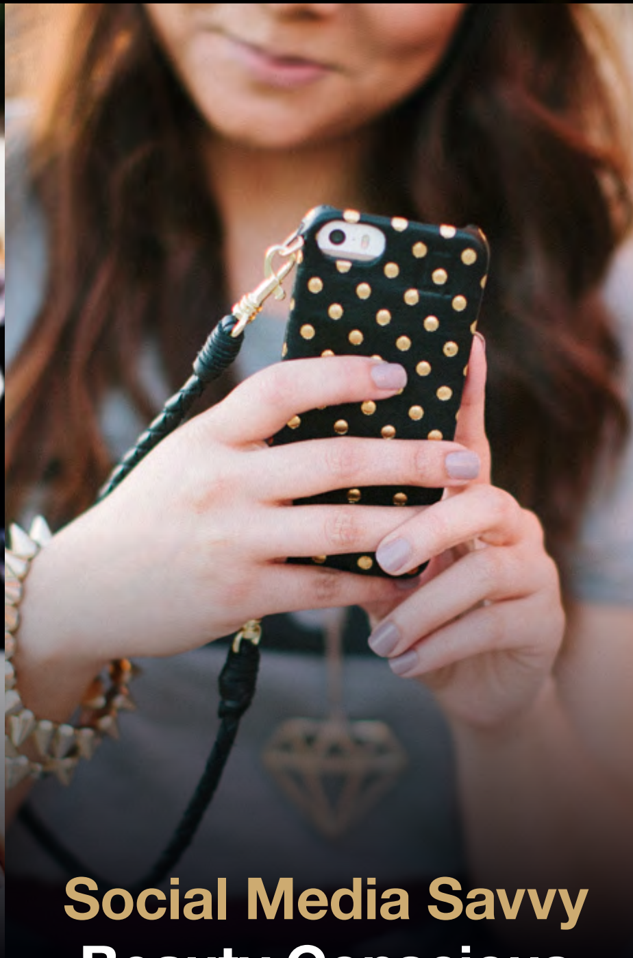
Social Media Savvy Beauty Conscious