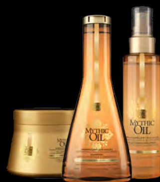
Fine Hair Regimen Shampoo, Masque, Oil Detangling Spray