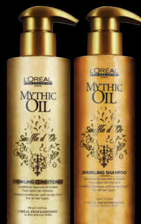
Souffle d'Or Shampoo & Conditioner