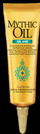
Scalp Clarifying Concentrate