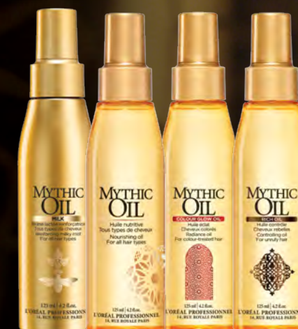
Oil Reinforcing Milk, Nourishing Oil, Colour Glow Oil, Rich Oil