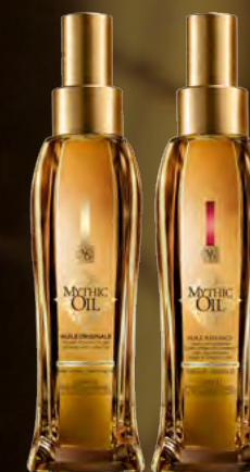
Oils Huile Originale, Huile Radiance