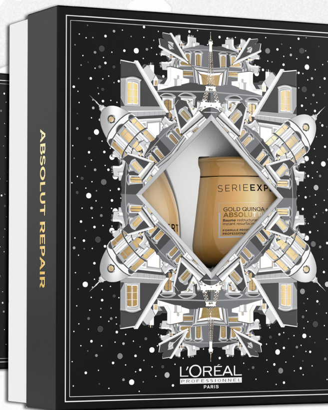
ABSOLUT REPAIR For damaged hair