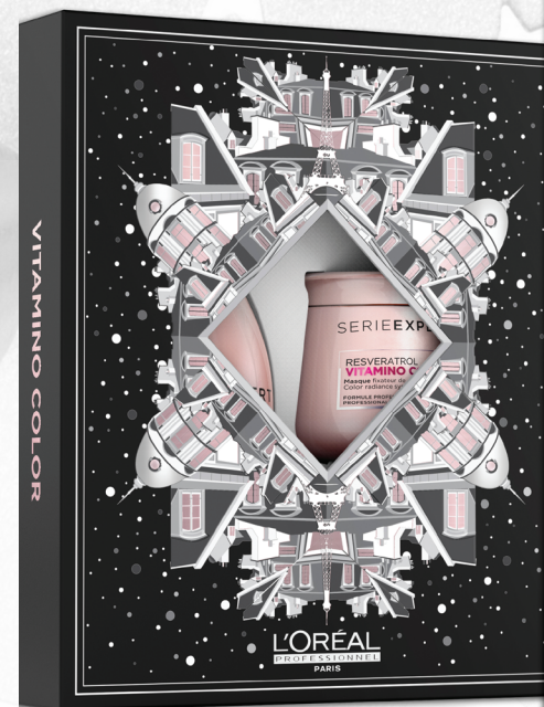
VITAMINO COLOR For color-treated hair

EXCITE YOUR CUSTOMERS WITH SERIE EXPERT GIFT SETS