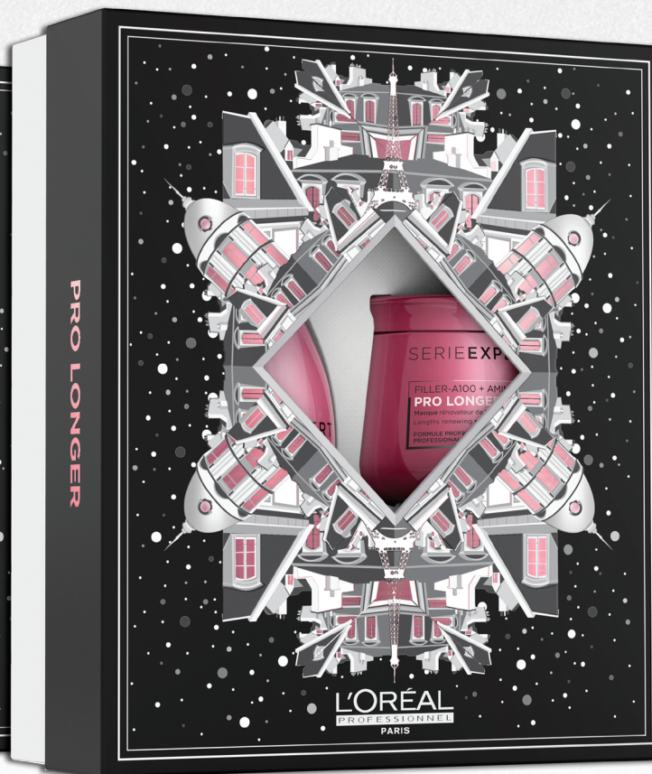
NEW! PRO LONGER For longer, thicker hair