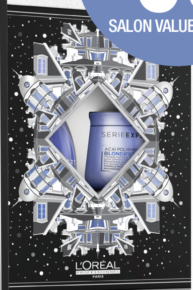
BLONDIFIER For blonde hair