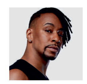
Derick Monroe @derickmonroe 3X Emmy nominated celebrity stylist Curl Expression co-developer